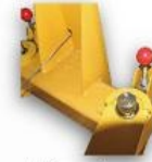
arm locking system